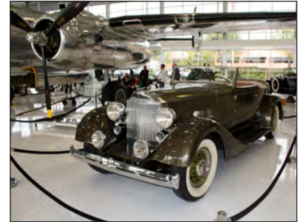
The Lyon Air Museum