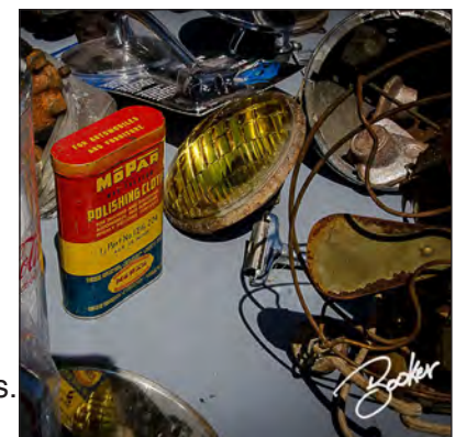
Fun stuff at the Swap Meet