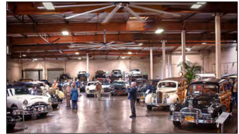
Crevier Classic Cars