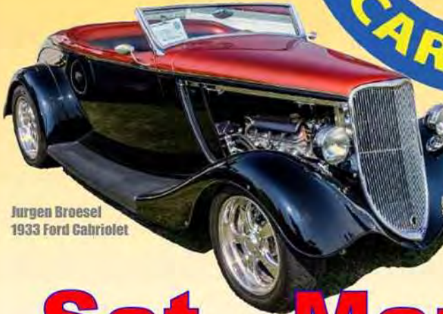
Jurgen Broesel 1933 Ford Cabriolet

In conjunction with Central Valley Sportsman, Boat & RV Show