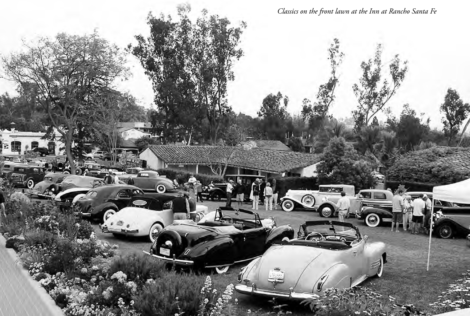
Classics on the front lawn at the Inn at Rancho Santa Fe

CLASSIC CAR REGISTRATION GOES TO NATIONAL-SEE OTHER FORM