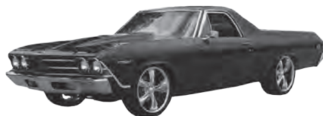
Rebel Smith's 1969 El Camino Chevy