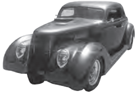
Don Rackley's 1937 Ford Coupe