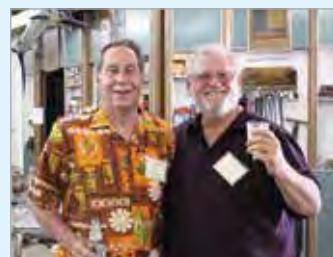
Thursday, meet up in the hotel lobby to pick up your registration materials and start the fun!

1:00 PM Farewell lunch at Sherman Library and Gardens in nearby Corona del Mar. Choose your entree: Grilled Flat Iron Steak with a romaine salad; Vegetarian Tacos with tempura sweet potato and slaw; and the Dahlia Salad with avocado and chicken. All topped off with Flourless Chocolate Torte.