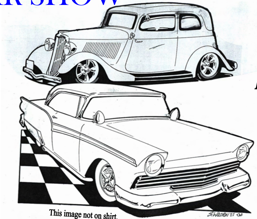
This image not on shirt.