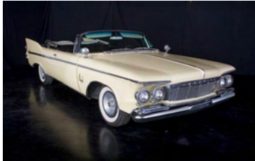
'55-'61 Finned Mopars