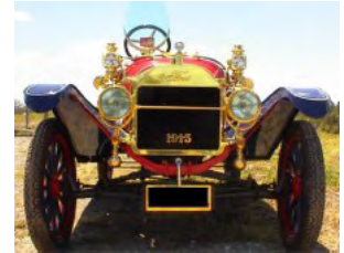
Brass Era Cars

Potter Junior High School in Fallbrook Show is Open to the Public 9:30 AM to 3:00 PM Spectators Free! - Free Parking! NO Dogs - NO Smoking - NO Alcohol - NO Exceptions Trophies for 25 Classes plus Non-class "Club Awards"