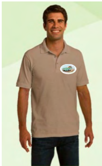
Men's Polo Shirt – no Pocket, Logo on Left Chest - $22.00