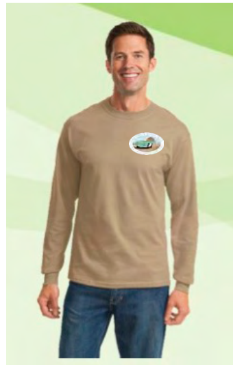
Men's Long Sleeve T Shirt – No Pocket, Logo on Left Chest and Back- $20.00