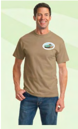
Men's T Shirt – No Pocket, Logo on Left Chest and Back- $17.00