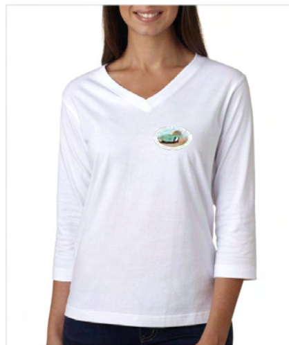
Woman's \frac{3}{4} Sleeve V Neck T Shirt Logo on Left Chest - $22.00