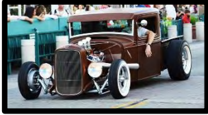
Best of Show 2017 Winner