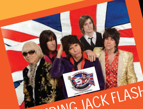
JUMPING JACK FLASH "Satisfaction"

In the heart of Glendale on Brand Blvd. FIREWORKS! FREE EVENT Trophies Awarded! Live Entertainment, Family Fun, and Activities SATURDAY, August 29, 2015 5:30 - 10:30 p.m.