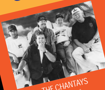
THE CHANTAYS "Pipeline"