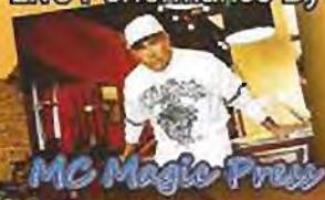
MC Magic Press