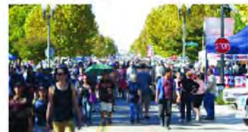
Murrieta Rod Run

All Proceeds will Go to the Students of Oak Grove Center