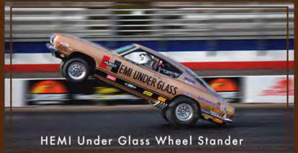
HEMI Under Glass Wheel Stander

Please bring a NEW $10.00 Unwrapped Toy!